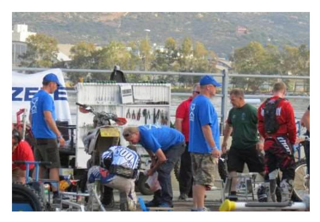
Parc Ferme – last minute tasks.

There was a new route today with some new tests added in. A long rocky river bed that went on for ever and an extreme downhill where riders could not use the front brake – and just kept it steady.