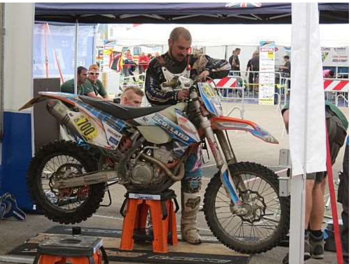
Final part of the day – no rest yet