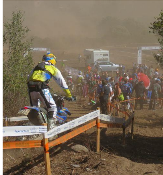
The 2 nd / 6 th test . Very dusty all day